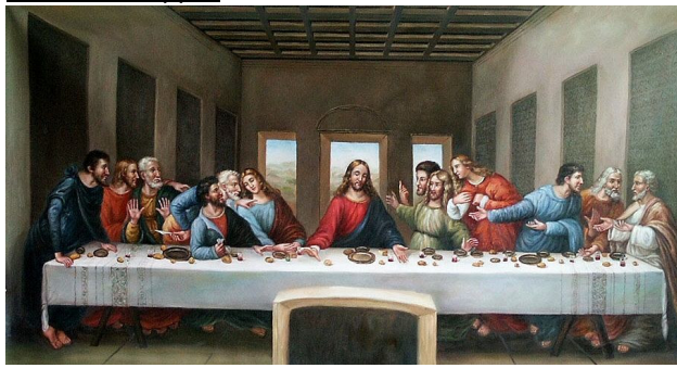
were kept safe.

On the first day of the Feast of Unleavened Bread or Passover, the disciples asked Jesus, "Where would you like us to plan for you to eat the Passover feast?" Jesus answered to them, "Go into the city and you will find a man, and tell him that we would like to come to his house for Passover." First of all, what is the Feast of Unleavened Bread, and what is the Passover? These are actually the same things. The Jews celebrated the Passover ever since the time of Moses, when the Lord saved all the Israelite babies from being killed by putting the sacrificed Lambs' blood on their doors so the death angel would pass them by. This was when the Lord 'passed over' their houses, and they